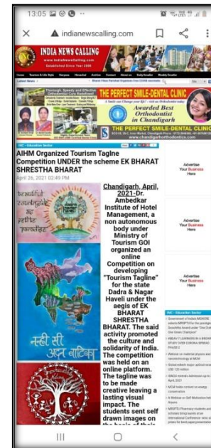
E-Newspaper Coverage of the activity